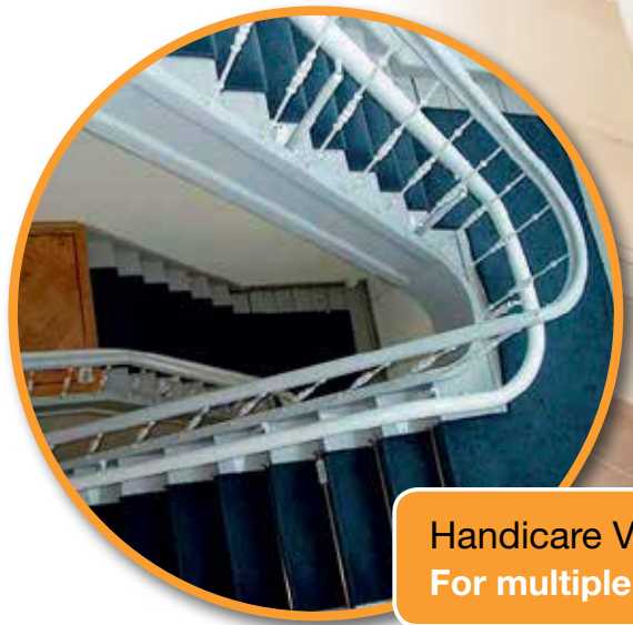
Handicare Vermeer For multiple floors