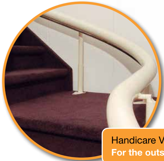
Handicare Van Gogh For the outside curve

Handicare has a solution for every staircase. All Handicare curved stairlifts share the same typical features: easy to operate, whisper silent and functional design. With our different types of stairlifts we are able to place a Handicare stairlift in every type of house and provide a safe and comfortable ride up even the most complicated of staircases. The compact design allows plenty of space for other stair users.