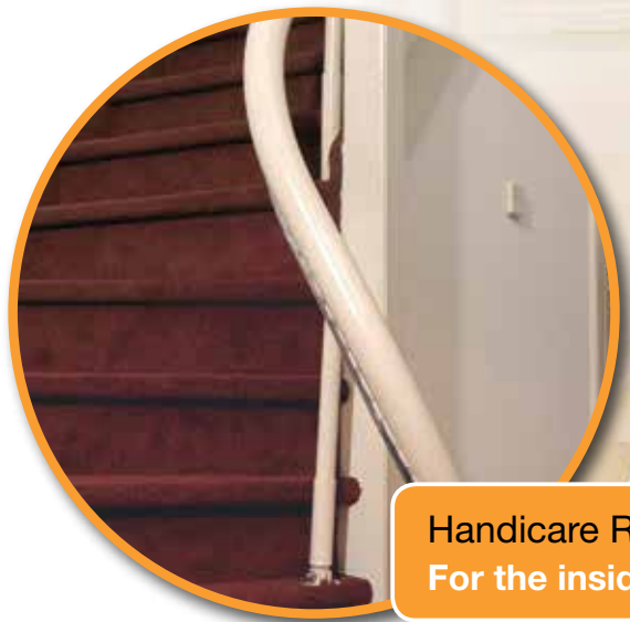
Handicare Rembrandt For the inside curve